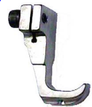
291-6739 1/4" Inside Foot