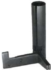
267238 Lever Bracket