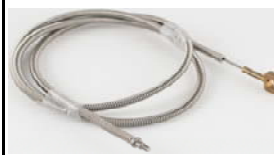
550184 Tension Release Wire