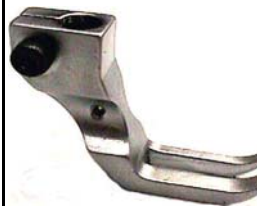
291-6849 1/4" Outside Foot