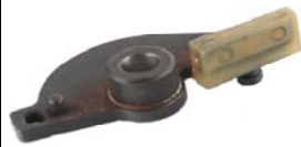
414132 Actuator Plate