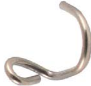
541787 (541669) Thread Guide