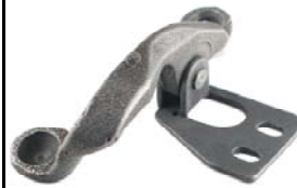
543465 (540617) Bell Crank Conn