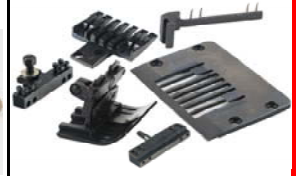
# 300W4-1.75 1/4"-1-3/4"-1/4"